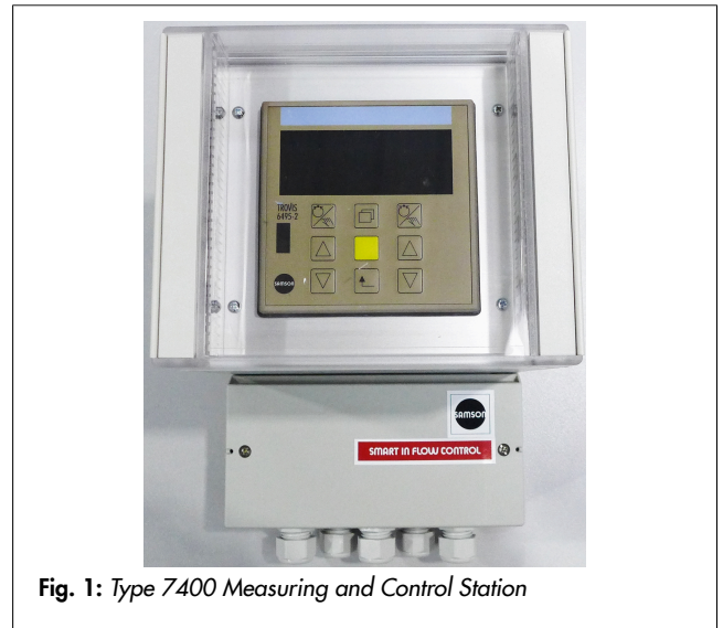
Fig. 1: Type 7400 Measuring and Control Station